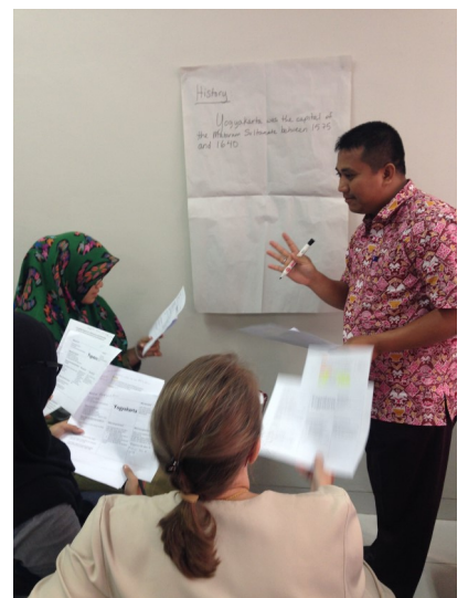
Some of our wonderful workshop participants doing a joint construction