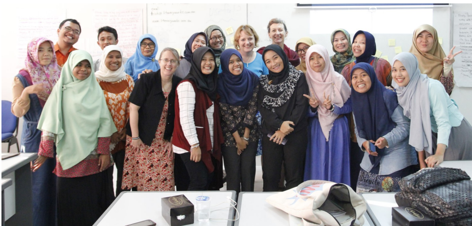
The participants in the workshops on Genre Based Approach (which is what the Indonesians call Teaching and Learning Cycle)