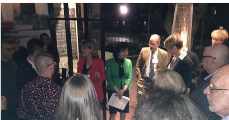
At the book signing